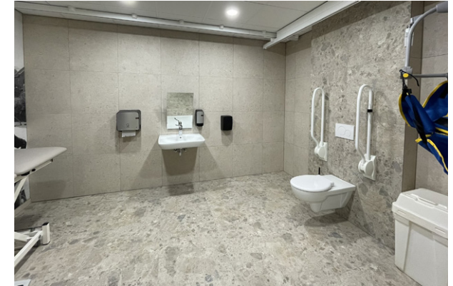
The Oorlogsmuseum Overloon is opening a new educational wing, which includes a fully accessible Changing Places Toilet.

Many children with severe disabilities need to be changed lying down, even as they grow up. Sanitary facilities are not designed for this. A day out with the family is often unfeasible. That is why we support top cultural locations to build Changing Places Toilets. These are welcoming and safe toilets, where lying down is possible and changing is comfortable. In 2025, we made six new Changing Places Toilets possible, including in the Efteling and the Oorlogsmuseum Overloon. In this way, we make a difference for many families who can go out together as a result.