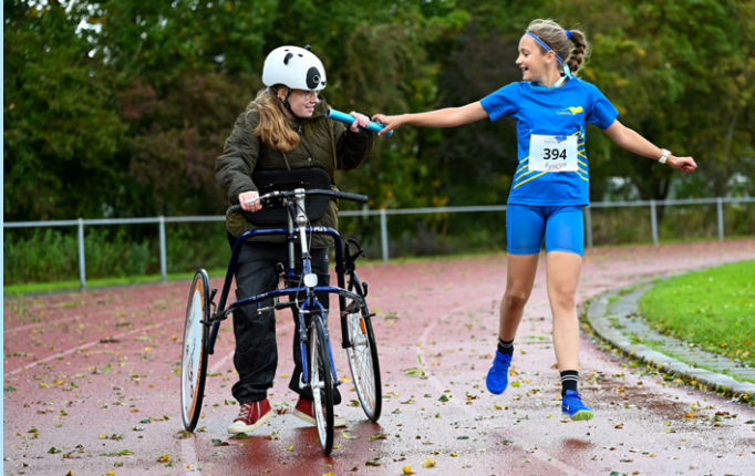
Together with the Atletiekunie, we ensure that children with disabilities can participate in sports at the athletics club in the area.